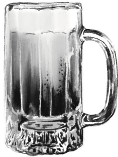
———— BEER ————